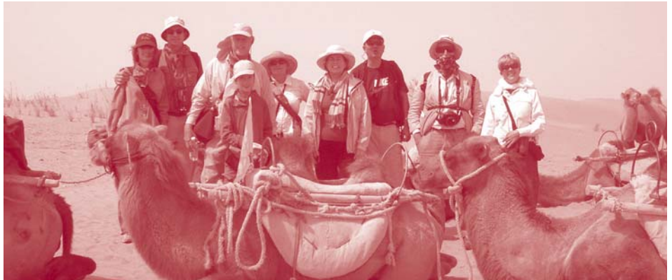
Camels await riders on the Silk Road.